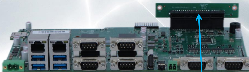
Expand card install interfaces